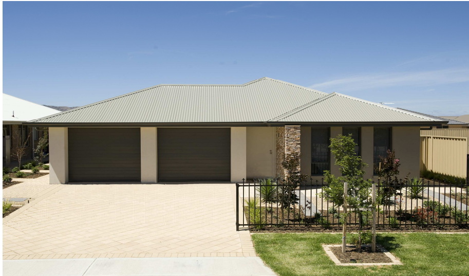
KYTON - Aldinga Beach